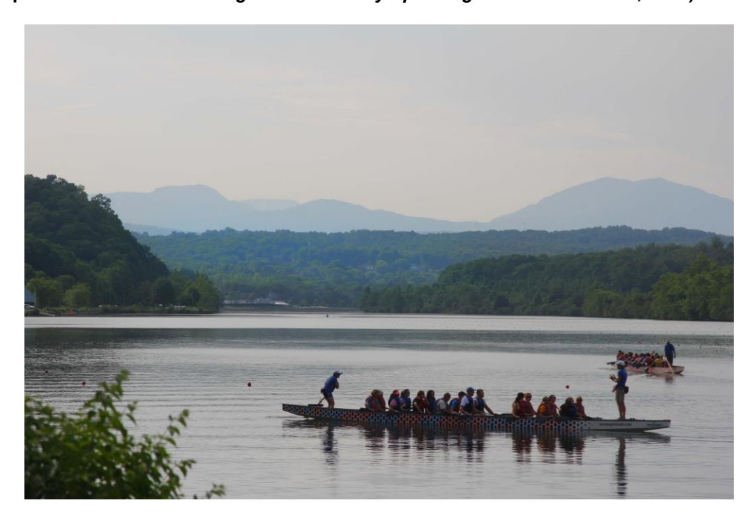
Dragon Boats practice as the teams prepare for Saturday's inaugural race